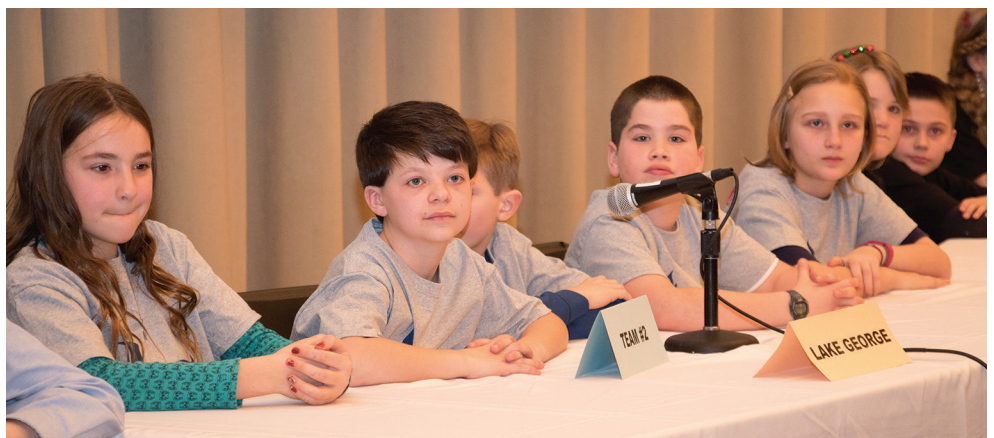
Lake George Elementary students took part in the annual Battle of the Books at Skidmore College.